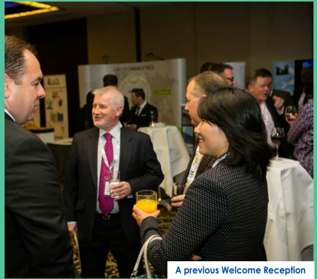
A previous Welcome Reception

The Welcome Reception will be the official opening of the ACI 9th Annual Airport Economics & Finance Conference & Exhibition. Taking place in the exhibition hall, the reception will allow delegates to visit exhibition booths, meet old friends and forge new relationships.