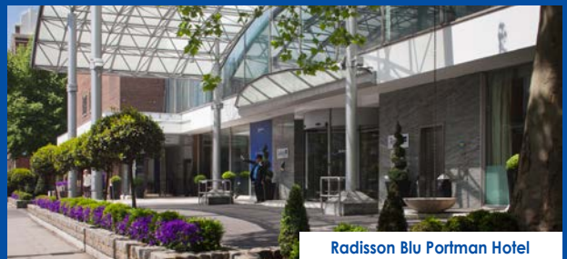
Radisson Blu Portman Hotel

To book a room please visit: www.miceconciierge.com/events/ACIAEF