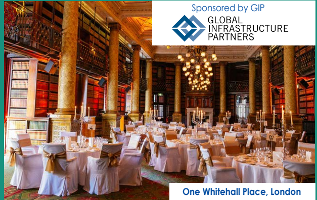
Sponsored by GIP GLOBAL INFRASTRUCTURE PARTNERS

Enjoy an evening of networking with fellow delegates, sponsors, exhibitors and speakers at One Whitehall Place, a unique and prestigious central London venue steeped in history and boasting many wonderful architectural features,